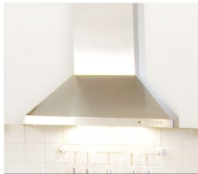
STAINLESS STEEL CANOPY RANGEHOOD