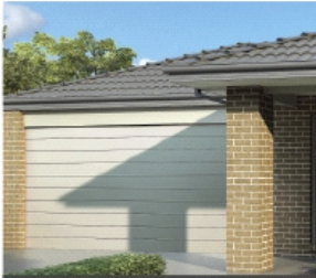
SECTIONAL GARAGE DOOR ^