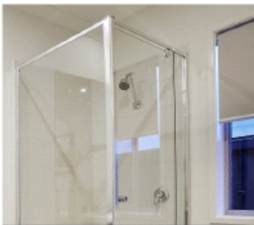
SEMI FRAMELESS SHOWER SCREENS