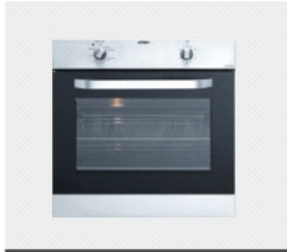
STAINLESS STEEL OVEN †