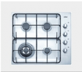
GAS STAINLESS STEEL COOKTOP