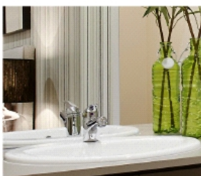
CONTEMPORARY TAP & OVAL BASINS