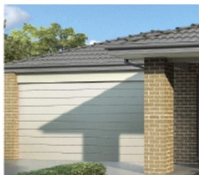
SECTIONAL GARAGE DOOR*