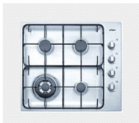
GAS STAINLESS STEEL COOKTOP