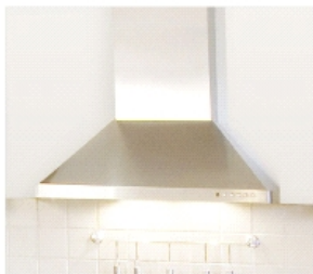
STAINLESS STEEL CANOPY RANGEHOOD