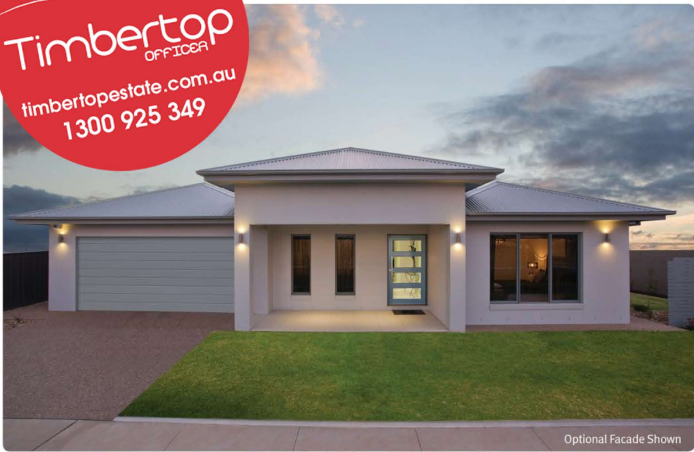
Optional Facade Shown